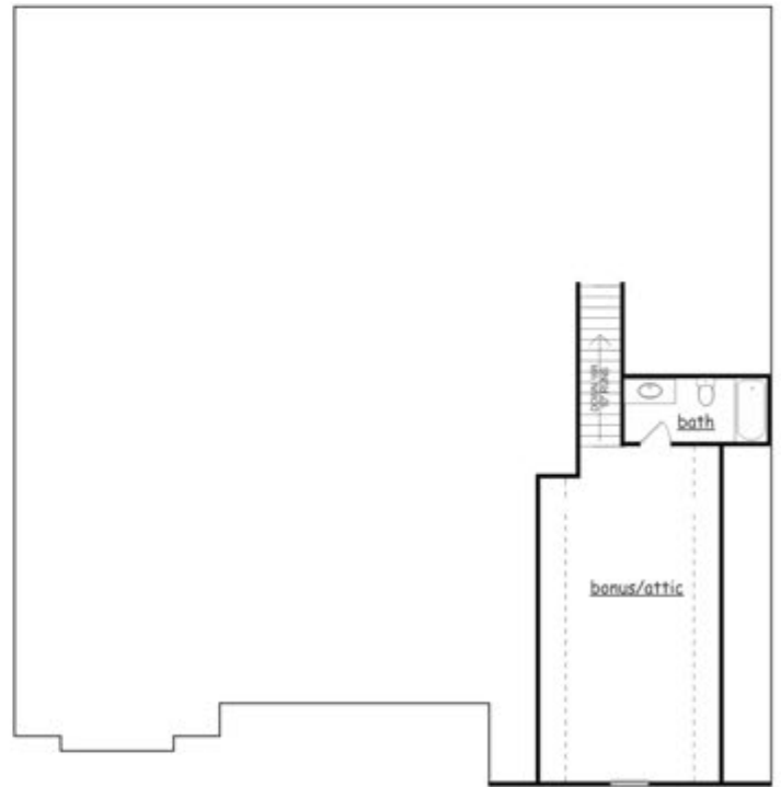
UPPER OPTIONAL LEVEL

All renderings are artist conceptions. Information is subject to changes, omissions and errors without notice. All is believed to be accurate, but is not warranted. The total square footage is based on the main level & upper optional level. Please consult with our Sales Professional Team for details.